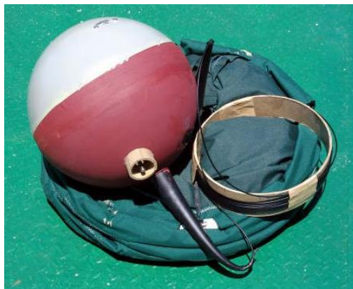
Figure 1: Satellite-tracked surface drifting buoy.

Mathematical and physical models have shown that with time the ocean currents aggregate the marine debris and create the so-called “garbage patches”. The models utilized to estimate the rate and location of aggregation are typically calibrated using both drifting buoy (“drifters+) trajectories and surface drift simulations using ship drift data.